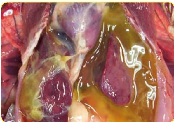
Figure 2. Opened abdominal cavity of an ascitic broiler chicken showing the abundance of ascitic fluid

Necropsy of the dead birds revealed the characteristic lesions of ascites. Amber or clear fluid (lymph) was found in the abdominal cavity, hearts were enlarged with fluid in the pericardium (the sac surrounding the heart), livers were swollen and congested and sometimes with fibrin adhered to their surface, and lungs were pale or grayish. (Figure 2). By the end of the week 7 the mortality in the Negative control and Positive control groups reached 15.39% and 7.53% respectively whereas the group fed diets supplemented with Biotronic® SE recorded the lowest mortality rate at 6.76%.